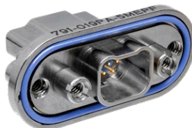
Shell size A – the smallest 791