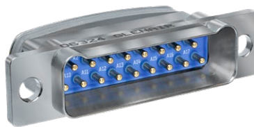
M-17P17 with size 16 contacts