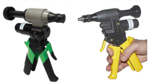
Hydraulic Earth Bond setting tools for aluminum and stainless steel plate