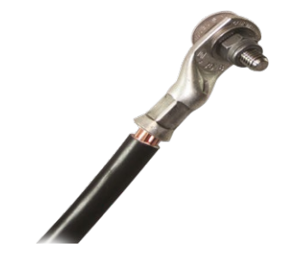
Used for ground strap bonding and equipment rack installation