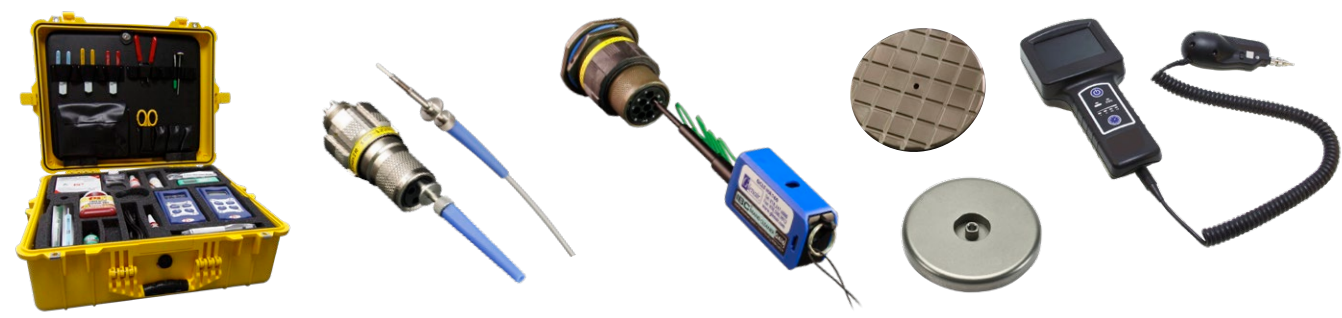
Turnkey fiber optic termination and maintenance kits