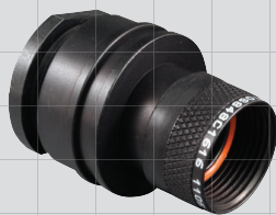
Sentry system, pages B-12 – B-23