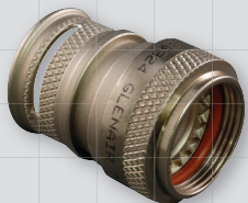
Easy-to-Install Guardian system, pages B-24 – B-31