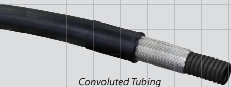
Convoluted Tubing configurations, pages B-2 – B-9

Prefer a Turnkey Solution? Glenair can terminate point-to-point or complex multi-branch annular tubing assemblies to fit your specific application requirements.