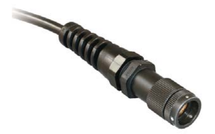
PG Adapter with Flexible Cordgrip, with CB Plug and Jacketed Cable

PG thread adapters fit all CB Series connectors with M14 x 1 accessory threads. These adapters accept all standard PG 7 liquid tight cordgrips.