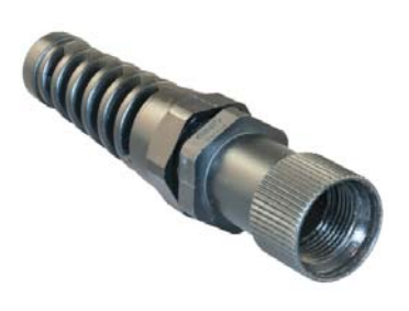
PG Adapter with Flexible Cordgrip