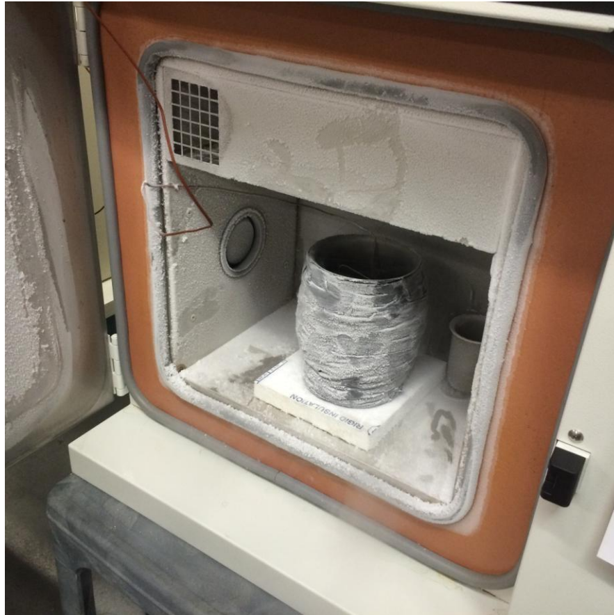
Figure 3: Samples were placed in environmental chamber in an insulated stainless steel beaker.

Test samples underwent Cryogenic Temperature Cycling and were visually inspected before and after testing. There was no evidence of cracking, peeling, or other mechanical degradation. Additionally, samples were helium leak tested before and after each cycle. There was little to no increase in helium leak rate once measured after cryogenic temperature cycling. See Table 4 in section 2.2 for measured leak rate values.