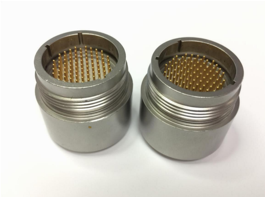
Figure 1: Test samples #1 and #2

Two items were tested. Test samples were designated Sample #1 and Sample #2.