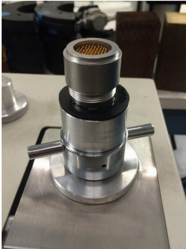
Figure 2: Test setup for Contact Resistance testing.

Samples were placed directly on helium leak tester port using a custom machined interface. Vacuum oil and Buna-N material were utilized to ensure a leak free connection. Before any leak testing was performed on the internal features of the connector the outer seal was checked to ensure there was no external leaks.