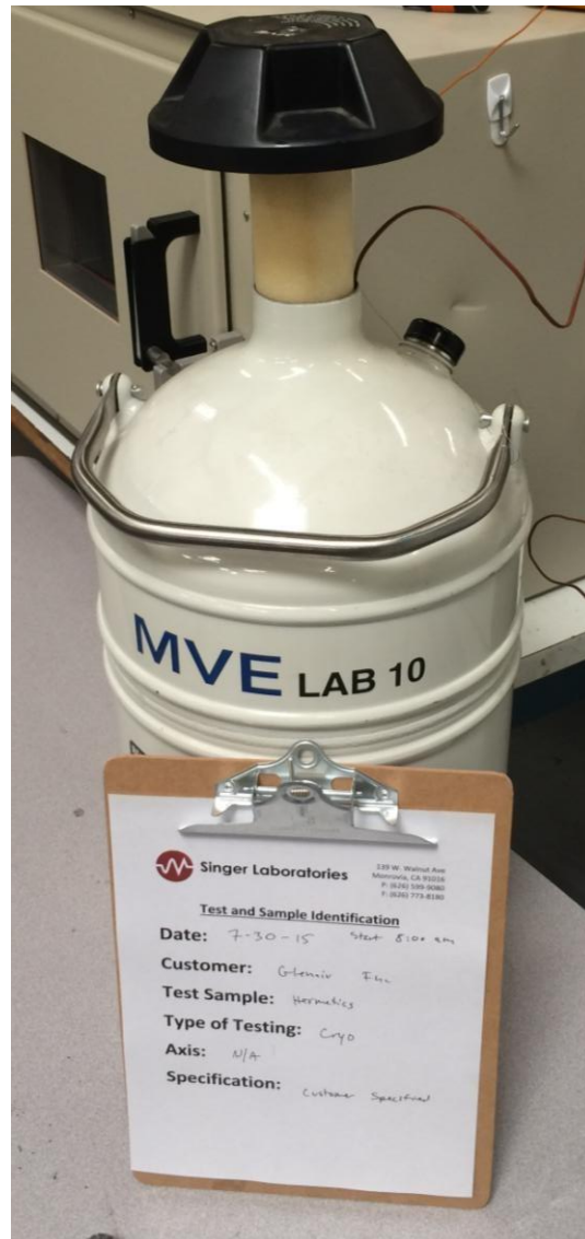
Figure 4: Test samples where immersed in liquid nitrogen for a two hour dwell time.

The results stated on this report relate only to the items specifically identified. This test report or calibration certificate shall not be reproduced in full, without written approval of the laboratory. Revision 2 (9/29/2017).