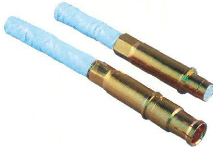
El Ochito White