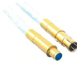
El Ochito Blue