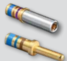
850-006 and 850-007 Extended-duty socket and pin crimp contacts