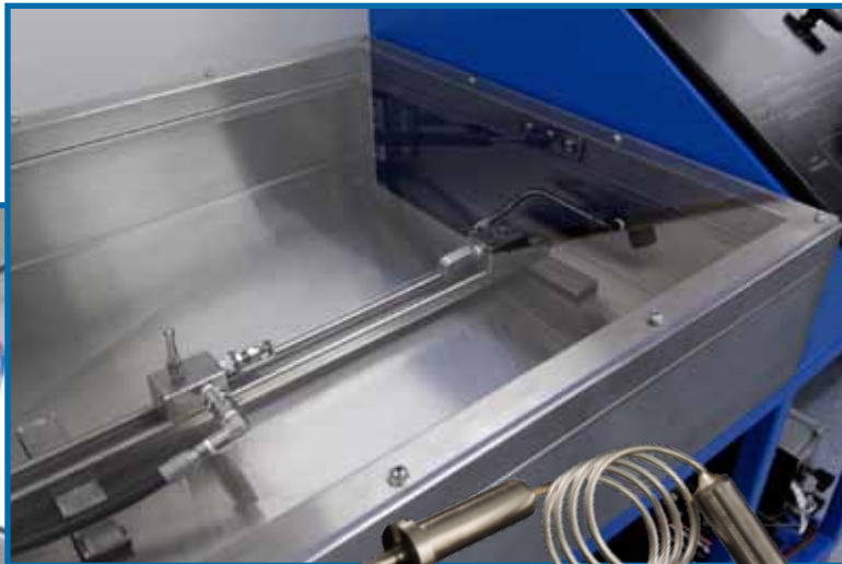
Pressure test and outgassing safety equipment