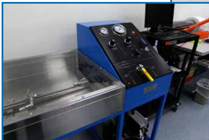
10,000 PSI pressure tester