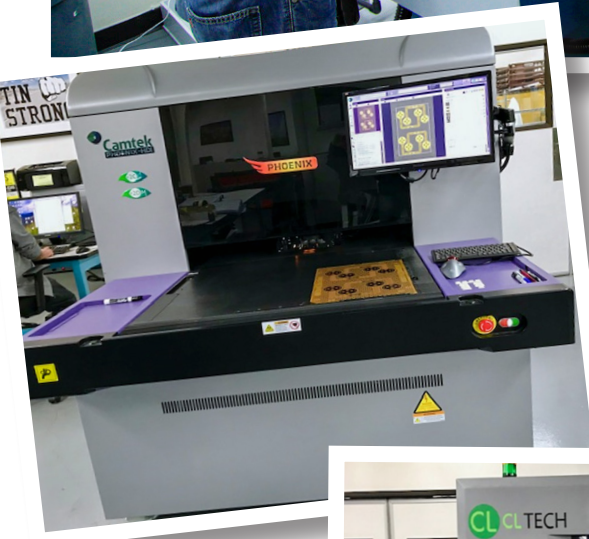
Automated Optical Inspection and Flying Probe Electrical Test