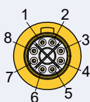
Mating face of Pin