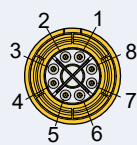
Mating face of Socket