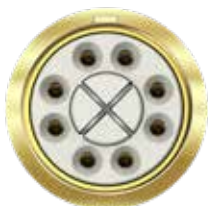
El Ochito® White for 40GBASE-T Ethernet, pin contact mating face

Save assembly time and cost with pre-wired, 100% tested El Ochito® White assemblies. These single-ended cables have El Ochito® White contacts terminated to Cat 8 aerospace-grade shielded cable. Supplied with cable grommet follower if applicable. Compatible with Glenair Series 23, Series 28, Series 792, Series 816, Series 806, ARINC 600 and EPXB connectors. Designed to meet the requirements of MIL-DTL-38999, SAE AS39029. El Ochito® contacts must be installed in keyed connectors before mating to prevent misalignment and contact damage.