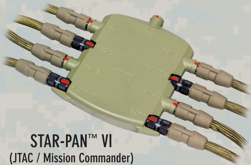
STAR-PAN™ VI (JTAC / Mission Commander)