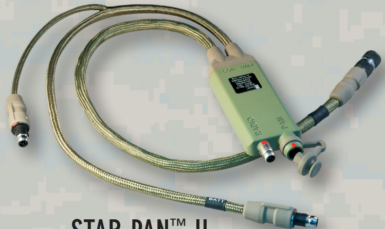
STAR-PAN™ II (Advanced Soldier)