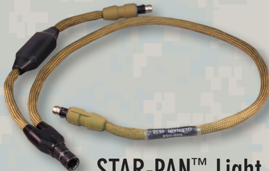
STAR-PAN™ Light (Standard Soldier)