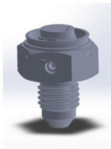
Step 1 Precision-machining of pressure port and stainless steel diaphragm