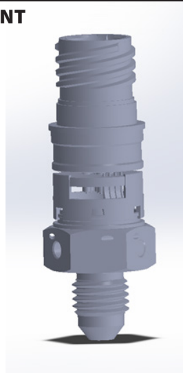
Step 3 Incorporation of housing and electrical EMI/RFI filter connector