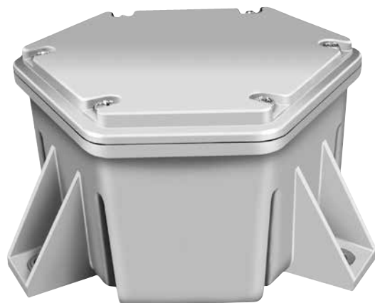
Three-Legged Series 140-106 CostSaver Composite Junction Box