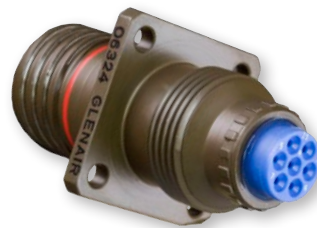
Splined MIL-DTL-28840 connector-to-backshell interface is ideally suited for heavy backshells and cables