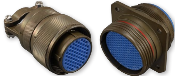
MIL-DTL-28840 qualified connectors in-stock and ready for immediate, same-day shipment