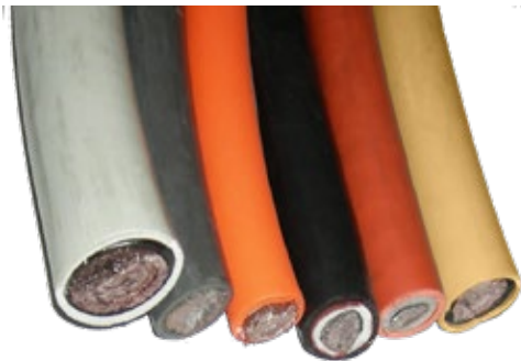
Bulk jacketed Duralectric™ cable with TurboFlex® flexible power cabling for harsh-environment power applications with cable routing challenges