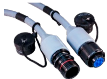
Shipboard application with Duralectric™ jacketing and overmolding