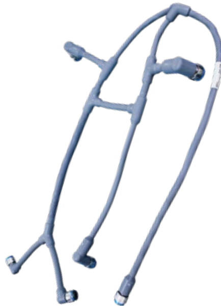
Complex multibranch overmolded cable assembly with rugged Duralectric™ jacketing