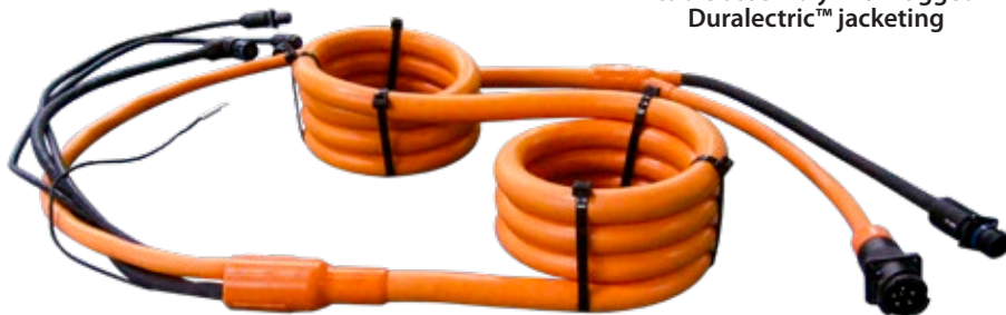
Turboflex® power pylon cable assembly with Duralectric™ jacketing