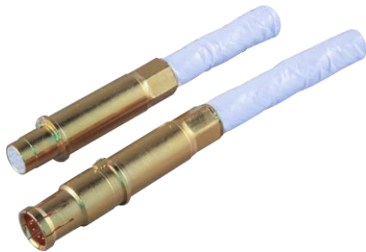
EI Ochito White Cable Assembly