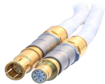
EI Ochito Type II Cable Assembly