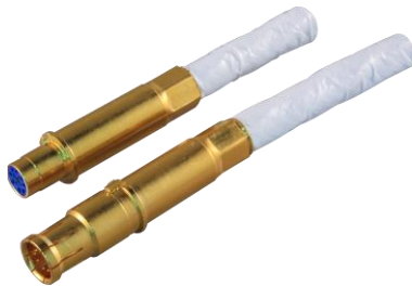
EI Ochito Blue Cable Assembly