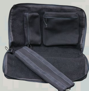
Mission Kit Bag ( TS4-011 complete kit shown)