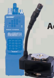
Universal Battery Adapter / Charger For Harris PRC-152A, PRC-152, and PRC-148 Radios