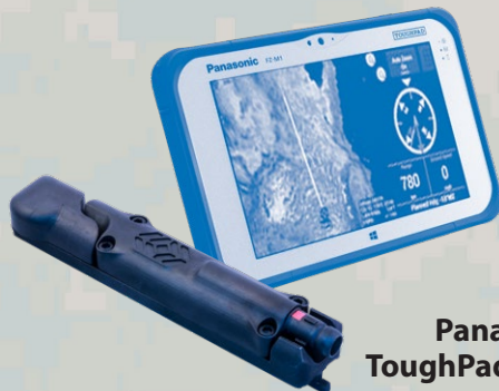
Panasonic ToughPad® Adapter