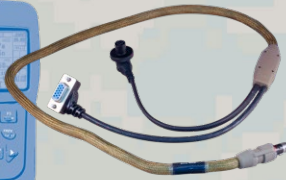
DAGR GPS Navigation Cable