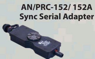
AN/PRC-152/ 152A Sync Serial Adapter