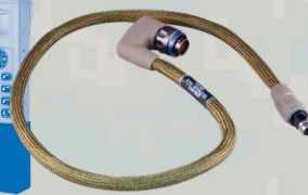
StrikeHawk Digital Adapter Cable