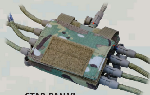
STAR-PAN VI MOLLE Pouch