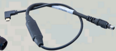
USB-C EUD Charging Cable