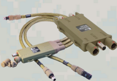
STAR-PAN™ II Hub / Cable Assembly and Connectorized Hub