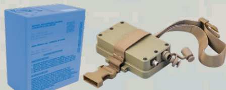
BB2590 Parallel Charging Battery Adapter with SMBus