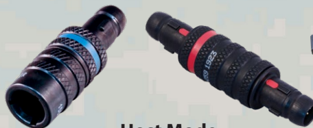
Host Mode Adapters and Gender-Changers