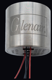
Redundant wired and Mechanical-Release HDRM designs