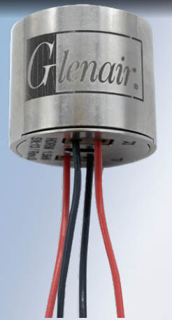
HDRM housings are precision-machined in-house with tolerances to 1 micron

Glenair's space system business unit in Salem manufactures hold-down and release mechanisms (HDRM) as well as customer-bespoke electromechanical devices. All products are manufactured in-house in our fully-integrated precision machining and metal fabrication center. All devices are clean-room assembled and inspected in a 3D optical profilometer and built in accordance with ESA standard ECSS-E-ST-33-01C