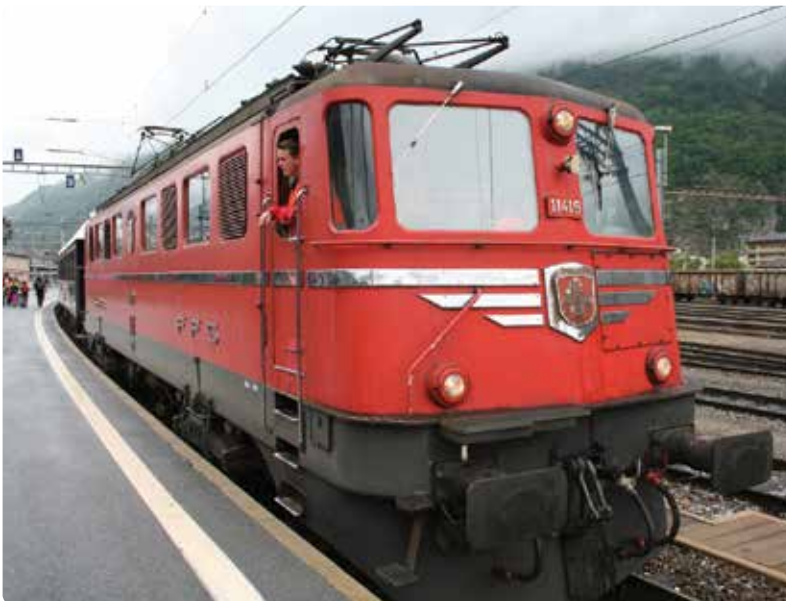
Urban and inter-urban rail systems are ideally suited for ruggedized 5015 type connectors.