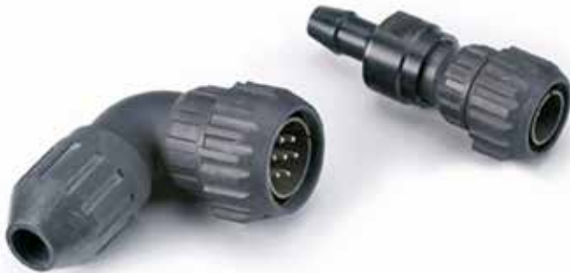
Glenair ITS-RG Connectors are designed for easy handling in harsh military applications.

Standard ITS inserts are made from neoprene, but high temperature silicon or solvent-resistant elastomer inserts can be specified. Series ITS connectors can be ordered with a flame retardant compound that significantly reduces fire hazards, and meets smoke density and toxicity standards.