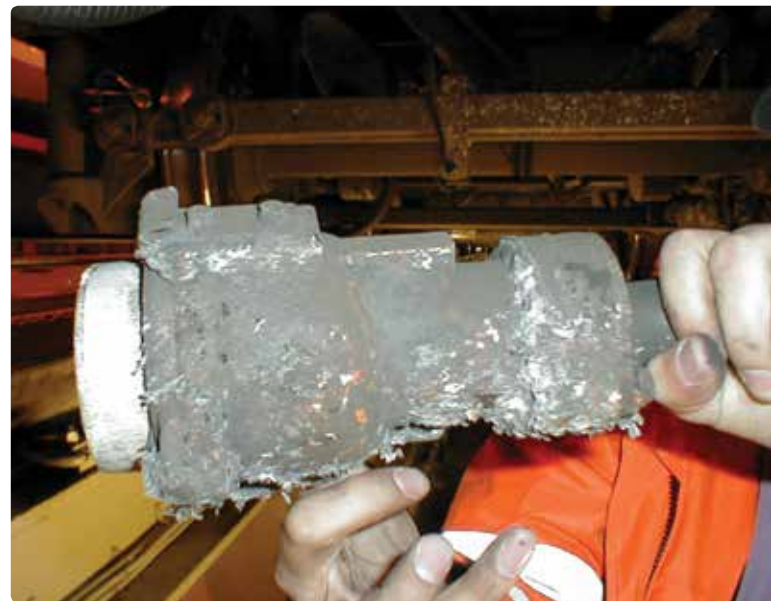
Connectors and cables see tough, environmental duty in rail applications. Poorly sealed products, or those made from inappropriate materials, can lead directly to system failures. Glenair Series ITS and ITS-RG are designed for the most severe environmental applications—from rail cars to military vehicles.