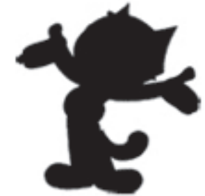
FELIX THE CAT