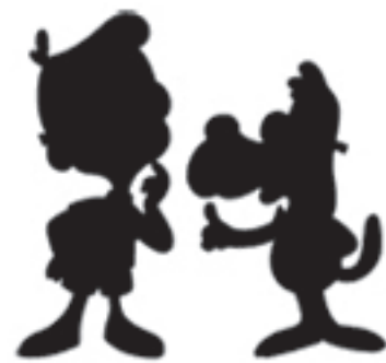
SHERMAN AND MR. PEABODY