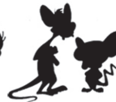
PINKY AND THE BRAIN