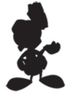
MARVIN THE MARTIAN