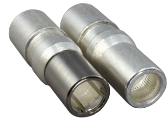
Figure 2 Conventional Contact on the Left, LouverBand Contact on the Right