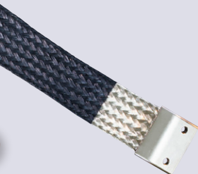
Specialized lug configurations including integrated bonding hardware and angled lugs