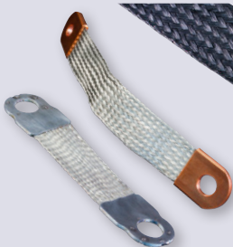
Hybrid braid materials and customizable lug material options