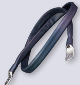
Harsh environment and chemical-resistant ground strap jacketing