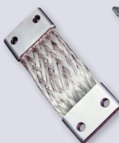
Heavy-duty braid and lug configurations