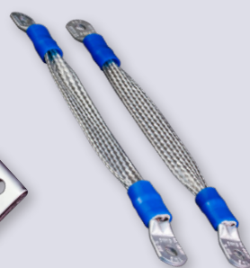
Round cross-section braid