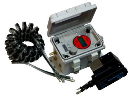
High Volume Pneumatic Tool