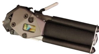
Hand Tool for Band Installation