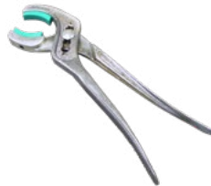
TG69 Soft Jaw Pliers