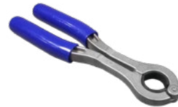
600-006 Coupling Nut Wrench