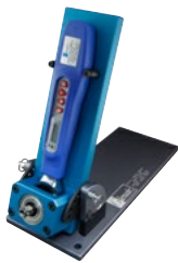
600-162BV Bench Mount Torque Wrench

For more information: https://www.glenair.com/tools/