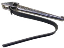
TG70 Strap Wrench