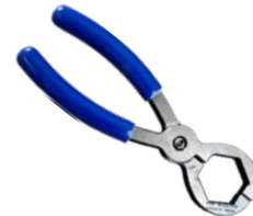
600-157 Composite Coupling Nut Wrench