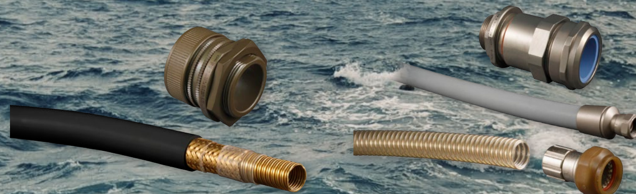
Series 75 Metal-Core Conduit Systems