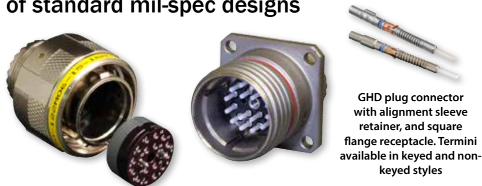
GHD plug connector with alignment sleeve retainer, and square flange receptacle. Termini available in keyed and non-keyed styles

The system of choice for military and commercial air, space and other applications: Outstanding optical and environmental performance with nearly double the density of standard mil-spec designs