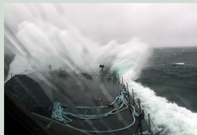
Glenair MIL-DTL-24749 Rev. C Type IV Stainless Steel/Nickel Ground Straps: US Navy qualified and tested to survive extreme environments

Lugs - 316L Stainless Steel/Passivate Braid - 316L Stainless Steel 36 AWG, 50%; 200 Nickel 36 AWG, 50%